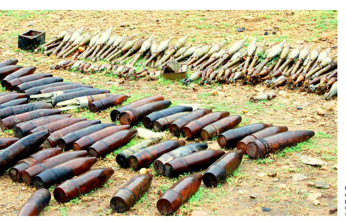
Unexploded ordnance continues to pose a threat to people and the environment well after a conflict has ended.

A review of 40 cases of NbS in fragile and conflict-affected settings, drawing on a newly published online <u>Catalogue of Nature-based Solutions for Peace</u>, the Global Environment Facility (GEF) and other sources (see <u>Annex 1</u>), suggests a number of common risks and opportunities. This section attempts to capture the key lessons from this emerging practice.