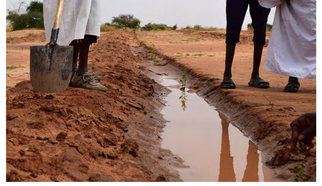
Community Forestry Arab Bashir.