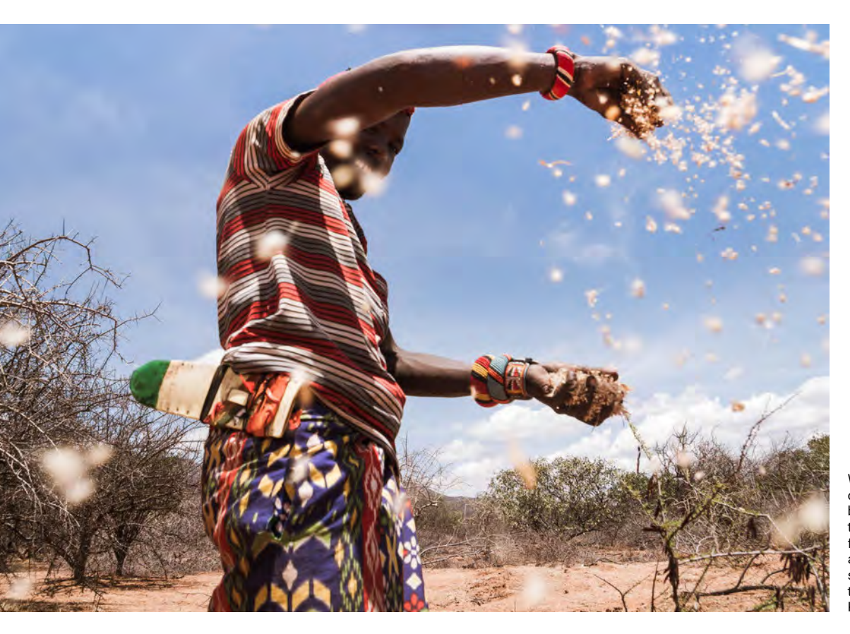
When trees are cut as part of rehabilitation projects, the branches are spread over the earth, helping prevent further erosion during rain, and also protect grass seeds sprinkled amongst them from herbivores, 2022, Kenva.

To manage the risks of unintended consequences, successful projects have adopted flexible, adaptive approaches. For example, in the DRC cases, corrupt conservation officials were a serious weak point in many of the projects, allowing for armed group activity in priority conservation arenas. By identifying these actors and targeting programming to address corruption, projects in Virunga Park were able to simultaneously improve conservation and reduce the risks of armed group activity. Similarly, programming to address the risks posed by environmental degradation in Burkina Faso referred to "ecosystem-based adaptation" as the method for addressing systemic risks to both the environment and communities.<sup>52</sup> A review of GEF-funded projects in Africa suggested that adaptive management approaches were fundamentally necessary for fluid, conflict-affected settings [14]. The final section reflects on how NbS projects can be developed as adaptive, flexible interventions in the fluid context of conflict.