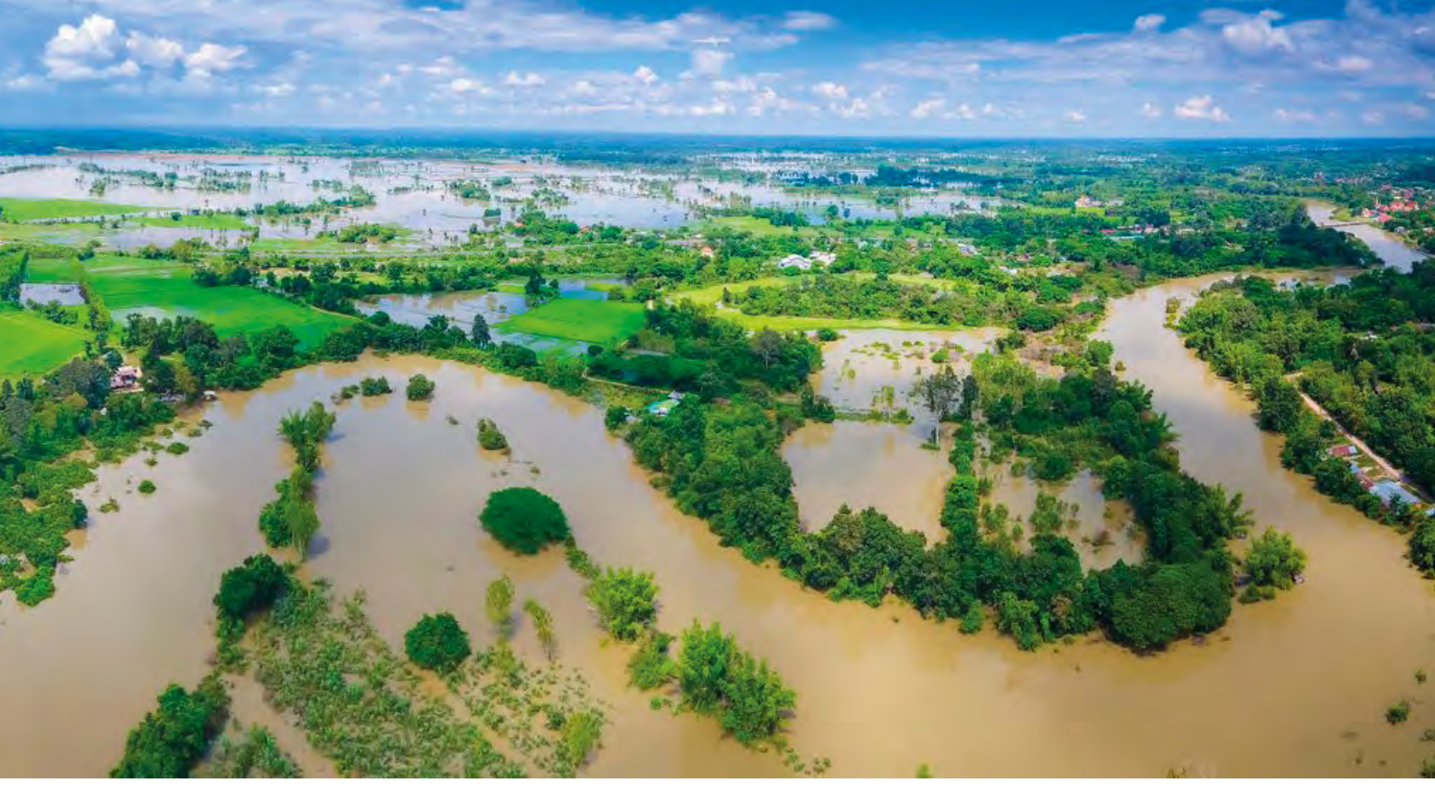
Flooded rice fields in Thailand.

The concept of NbS has faced criticism as well, which tends to be based on the following concerns: