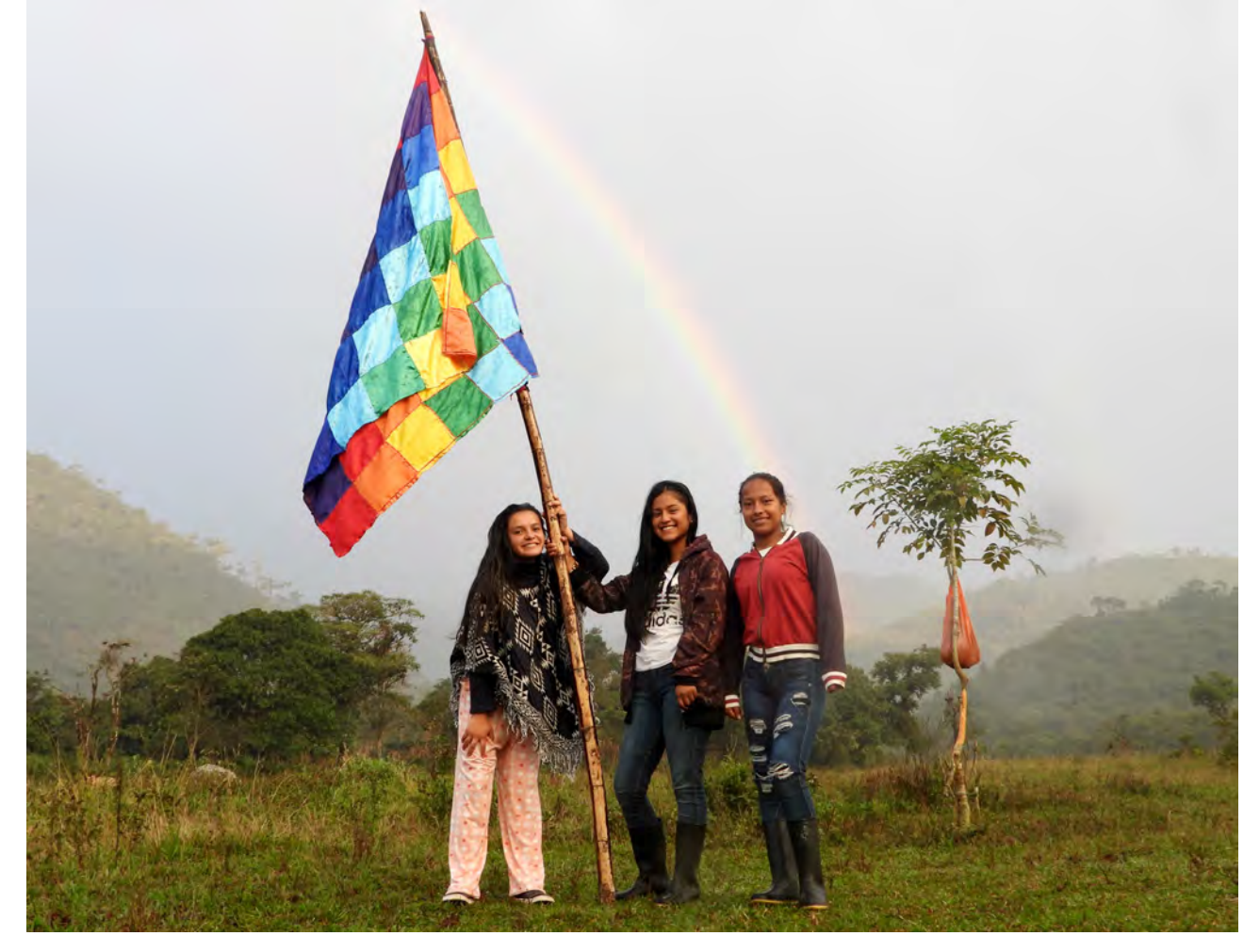
Youth of the Fundación Brisas del Macizo committed to peace and environment in Santa Rosa, Colombia.

Today, the field of climate, peace and security consists of scholarship and practice that considers all human-caused environmental change, its impacts on the risks of violent conflict, and responses that address both conflict prevention and ecological preservation simultaneously.<sup>21</sup> As such, it includes NbS as one set of practices that can reduce the risks of violent conflict.<sup>22</sup> On this basis, conflict-sensitive environmental guidance is referenced in some NbS programming, but has not yet become standardized in practice.<sup>23</sup> The following explores how the emerging practice of NbS could contribute to more systematic joined up action across environmental and peacebuilding programming.