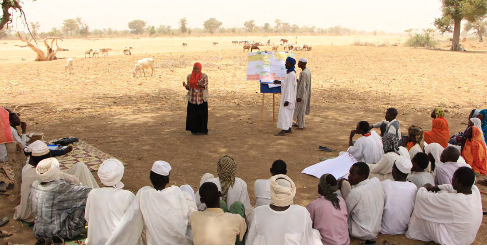
Community workshop in Sudan.